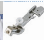
Taping (Elastic) Foot SA212

To attach tapes and elastic to stretch fabrics.