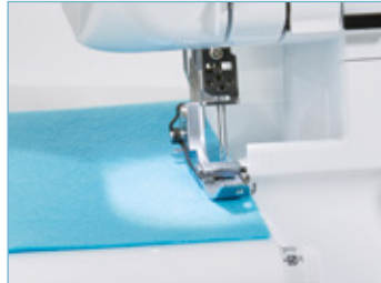
LED work light