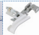
Pearls and Sequins Foot SA211