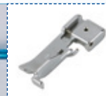
Piping Foot SA210

To attach piping between two layers of fabric.