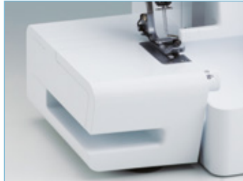
Free arm / Flat bed convertible sewing surface