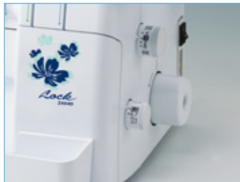
Easy access controls