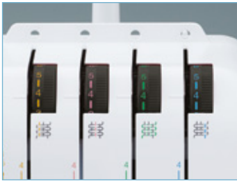
4 colour easy threading guide