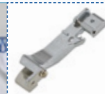
Gathering Foot SA213

For gathering and sewing in one operation.